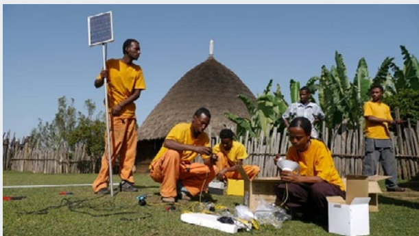
Figure 4: Solar Home Systems installation in Ethiopia.

Ethiopia has rural areas that are densely populated. However, 73% percent of the population living in rural areas lack access to electricity. They use kerosene lamps that are inefficient and adversely affect the environment. SHS has played an important role in providing clean energy to rural households in the country. Households in rural Ethiopia generally have SHS, with up to 4 lamps. One SHS with 2 lamps reduces carbon emissions by 0.25 tCO 2 compared to kerosene lamps. [10]