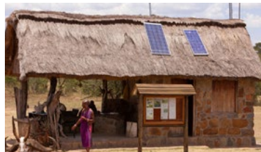
Figure 1: Solar home system in a village household set-up [11]

These systems generate DC power, which can be customised and converted to AC power with the help of an inverter. Due to the intermittency in solar energy, the battery is used to store the energy to meet the electricity demand at night and on cloudy days. The charge controller is also used in SHS to regulate the voltage for system batteries.