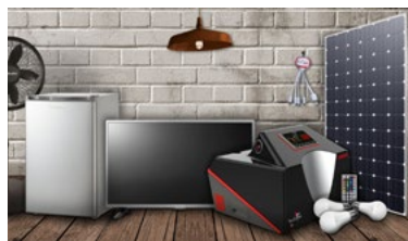
Figure 2: Components and appliances for a typical SHS [11]